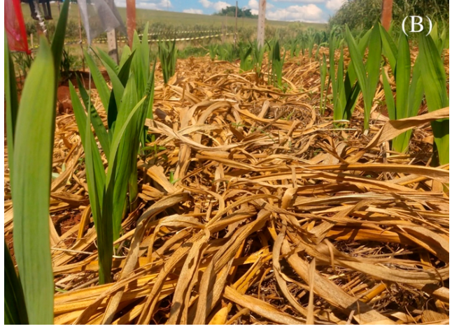
Figure 1. Image of experiment with shading nets in black, silver and, red with 35% shading intensity and without net (A) in production of gladiolus cultivar White Goddess with and without mulching (B) in conditions of Cfa climate of Paraná state, Brazil, during winter 2020 season. Dois Vizinhos, UTFPR, 2020.