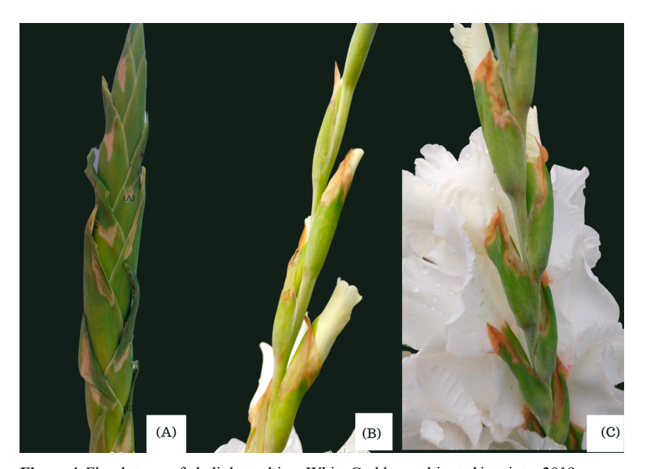
Figure 4. Floral stems of gladiolus cultivar White Goddess cultivated in winter 2019 season in conditions without shading showing damage to the sepals greater than 1 cm in stages of beginning of earing (R1) (A), harvest point (B) and in full bloom (C) in Cfa climate of Paraná state, Brazil. Dois Vizinhos, UTFPR, 2020.

20.8% and 20.3%, respectively (Figure 2A and 2D). Plants of the winter 2020 presented stems with lowest commercial quality. Evaluating the shade nets, the highest plants in class 110 were observed in autumn 2019, at 25%, 25%, 31.3%, and 37.5% for black, silver, red, and without shade nets, respectively (Figure 2A).