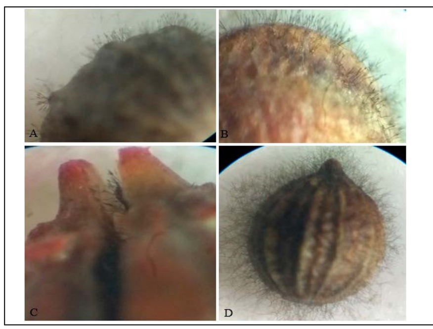
Figure 2. Detail of the association of fungi of the genus Alternaria in coriander seeds: A. dauci on the surface of coriander seeds (A and B) and inside the fruit (C) and A. alternata adhered superficially (D). Pelotas, UFPel, 2020.

had already been confirmed by data on feasibility found by the tetrazolium test (Table 1, Experiment I). However, the seeds do not always fulfill their maximum potential, mainly because they are infested, predominantly, with fungi with pathogenic potential, as was detected in the health analysis. Thus, seed treatment possibly contributed to an improvement in the physiological performance of these seeds.